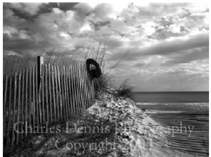
“Lifesaver East Beach on the Fence”