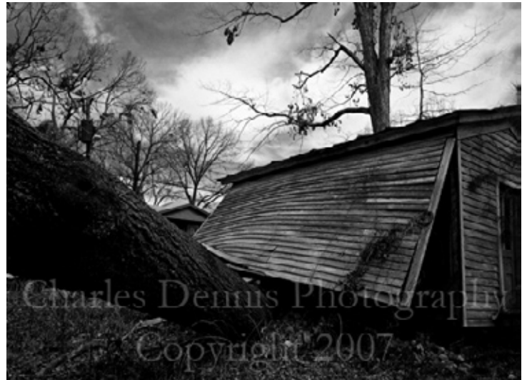
“Boylan Ave. #7”

Hurricane Fran, Raleigh, North Carolina – Destruction series was awarded honorable mention in Deeper Perspective, Editorial – Environmental, and Nature – Trees. The photos included in this series: