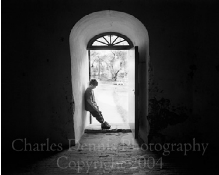
“In the Doorway of Old Baldy”

Sefton series was awarded honorable mention in People – Children, People – Portraits. The photos included in this series: